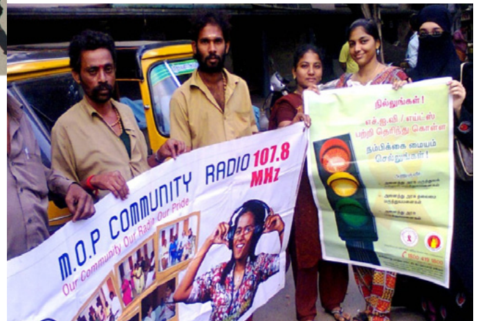
MOP Vaishnav CR 107.8 MHz conducting AIDS awareness campaign with Auto drivers

The month of December saw community radio stations across India come together and participate in a month long campaign to promote HIV/AIDS communication to encourage engagement with the local community. The campaign aimed to engage local communities through live phone-in programmes and bringing together NGOs and community workers. The stations were required to broadcast a minimum of 10 episodes with out reach activities as well.