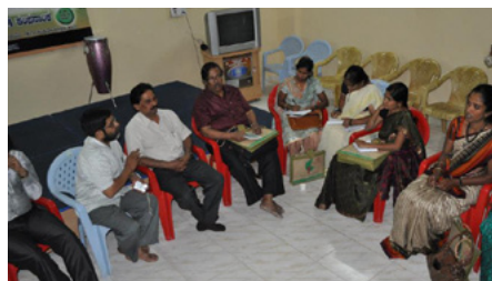
CRS of Karnataka come together in Dharwad

formation of the Karnataka Chapter. It was decided that the formation and the elections for the Karnataka Chapter will be held after the CR Sammelan in February 2013. The need for assistance from the Department of Information, Government of Karnataka, to support this initiative was also discussed.