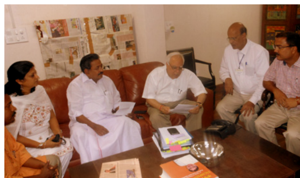
CRA members with Shri Kapil Sibal, Minister of Communications and Information Technology

This signing of the declaration was followed by a meeting of representatives from nine different states of the country in Delhi on July 13, 2011 which led to the formation of the Community Radio Association (CRA). The objectives were clear - to provide a platform to all functional community radio stations to voice their experiences/voices, to strengthen and develop the community radio movement in India and to give a voice to the voiceless community's they served. Subsequently, CRA was registered under the Societies Registration Act. XXI of 1860 in Delhi on August 23, 2011.