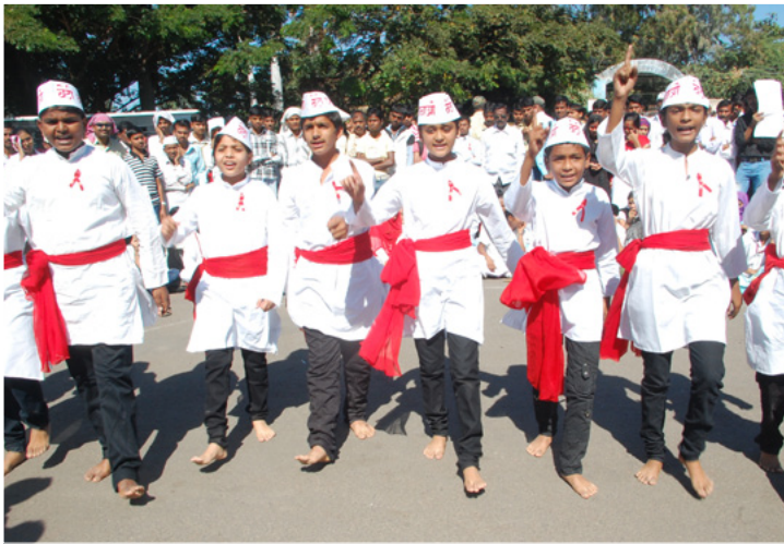
Campaign conducted by Vasundhra Vahini CRS in Baramati

The campaign saw active participation from community radio stations. They created special series of programmes on HIV/AIDS, organised rallies, produced songs, dramas and conducted interviews with experts and community members. The campaign aimed to increase awareness, educate and inform and fight prejudices. The result of the campaign which involved different categories of the awards like best radio series, the best campaign, best outreach event and the best RJ would be announced shortly.